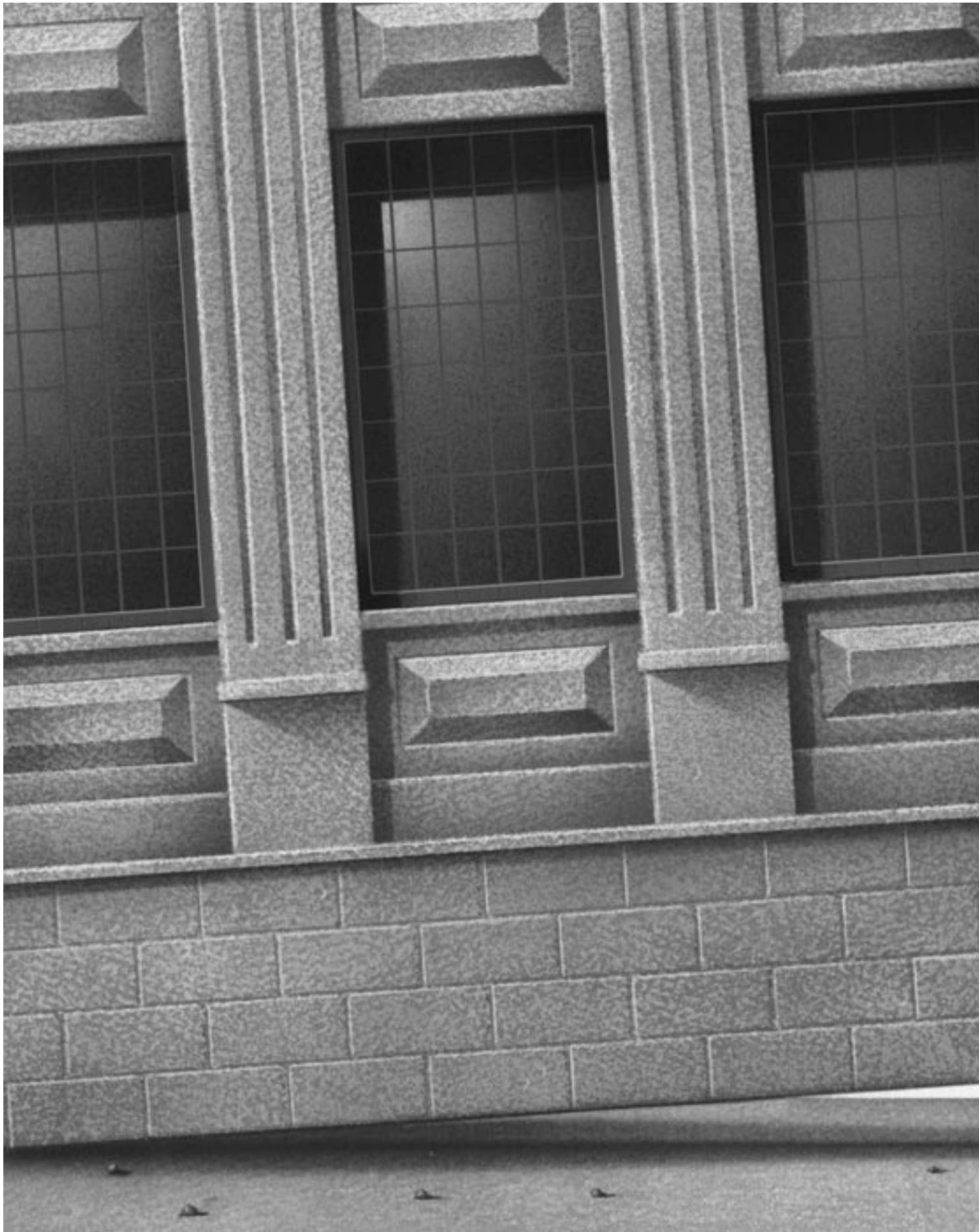
ILLUSTRATION BY THEO RUDNAK